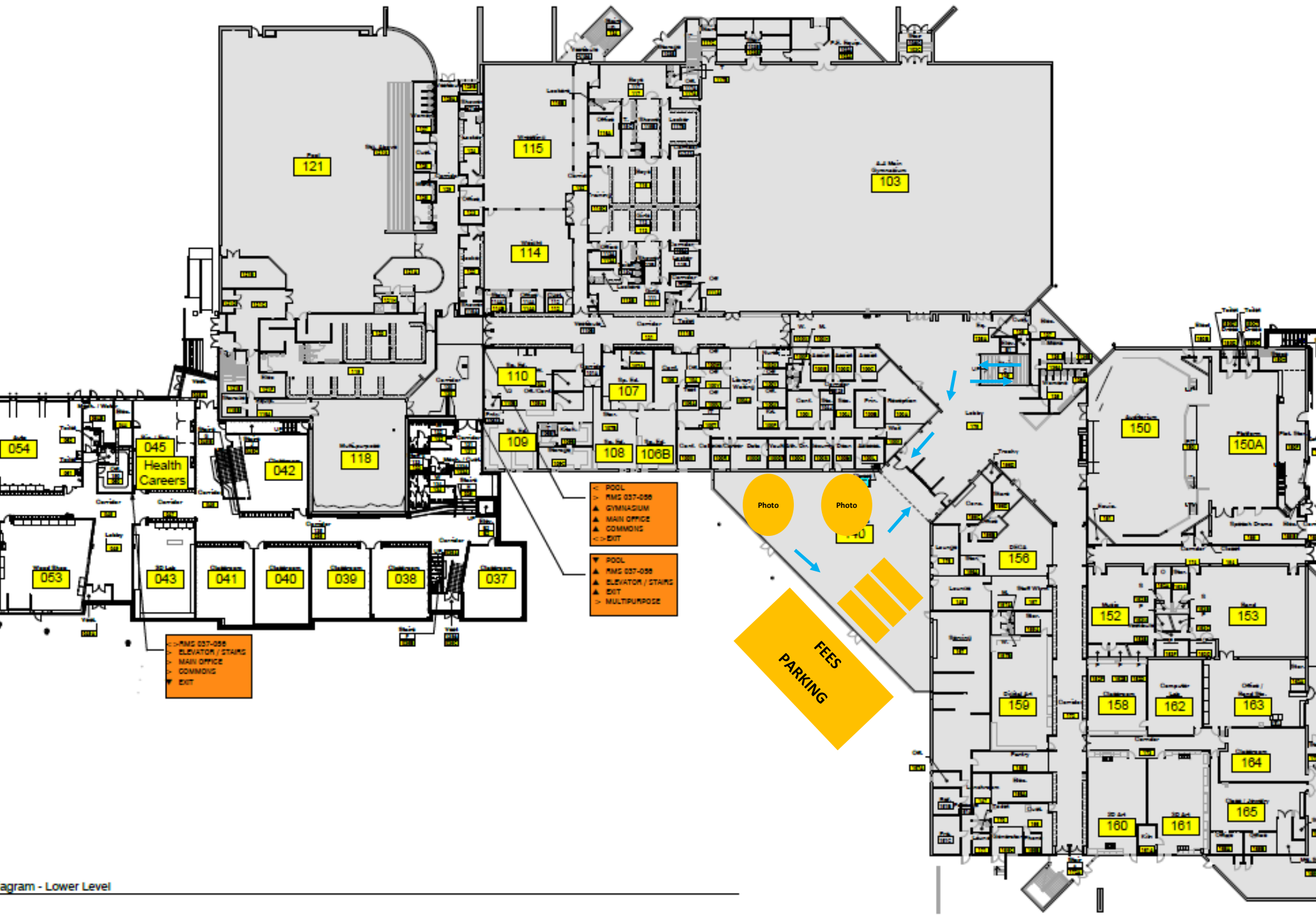
Diagram - Lower Level